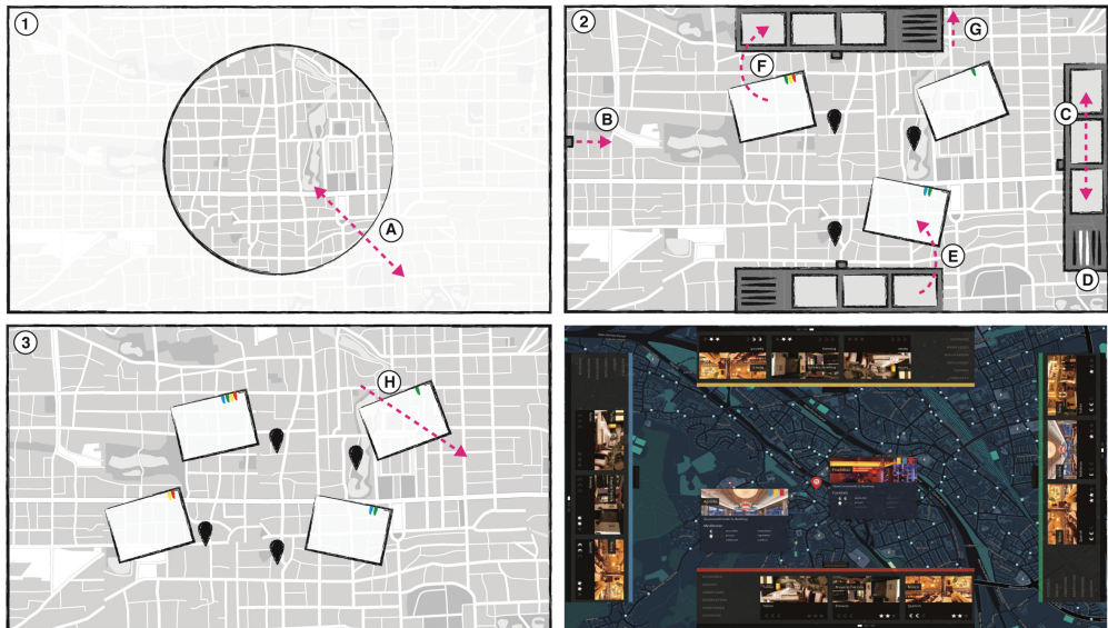
Figure 1. Illustration of the three phases of MTEatsplore, the possible interaction in these phases and a screenshot of the implemented version of the MTEatsplore in the second phase.

MTEatsplore supports a group of users planning to visit a restaurant together with collaboratively making a decision. By structuring their discussion, presenting adequate options and empowering everyone to put forth their position, MTEatsplore supports them with selecting a restaurant that best fits the preferences of all group members. MTEatsplore is optimised for ad-hoc formed groups of 2-4 users and supports various settings as for example in a hotel lobby or at a conference venue. Especially in such ad-hoc formed groups, where the group members do not know each other's preferences, choosing an adequate restaurant can be cumbersome. Particularly when personality traits and attributes like politeness, shyness, or reserve are involved—maybe even with conflicting characteristics of other group members like boldness, forwardness or rashness—finding an optimal decision can become tedious, or even conflict-ridden.